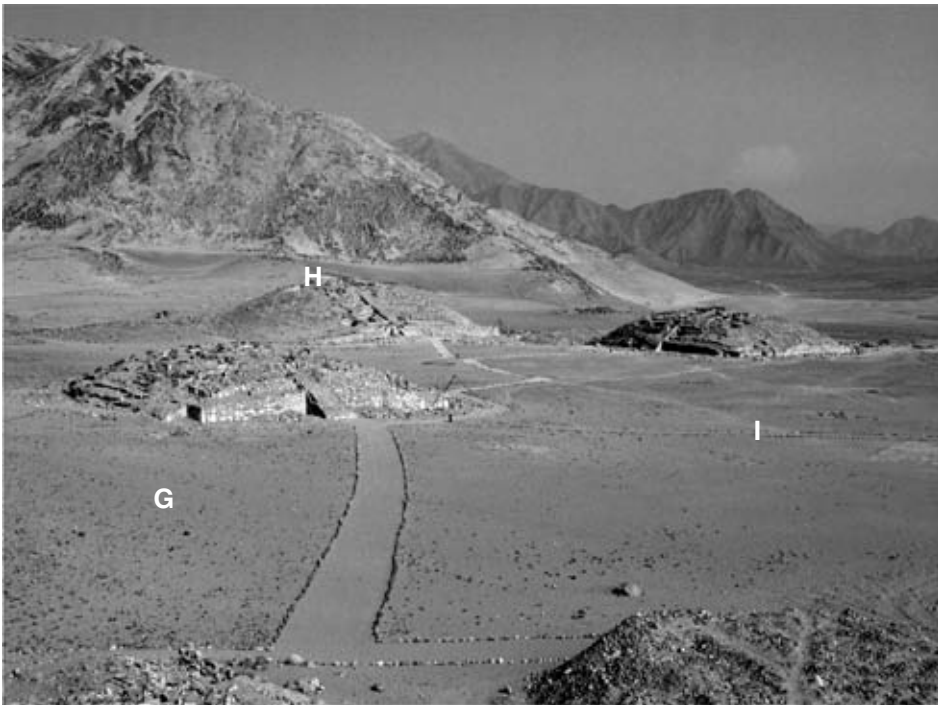
Figure 2.3. Plan of Caral (top, after Shady Solis et al., 2001) and photo of mounds G, H, and I at Caral, taken from Mound E (the Great Temple).