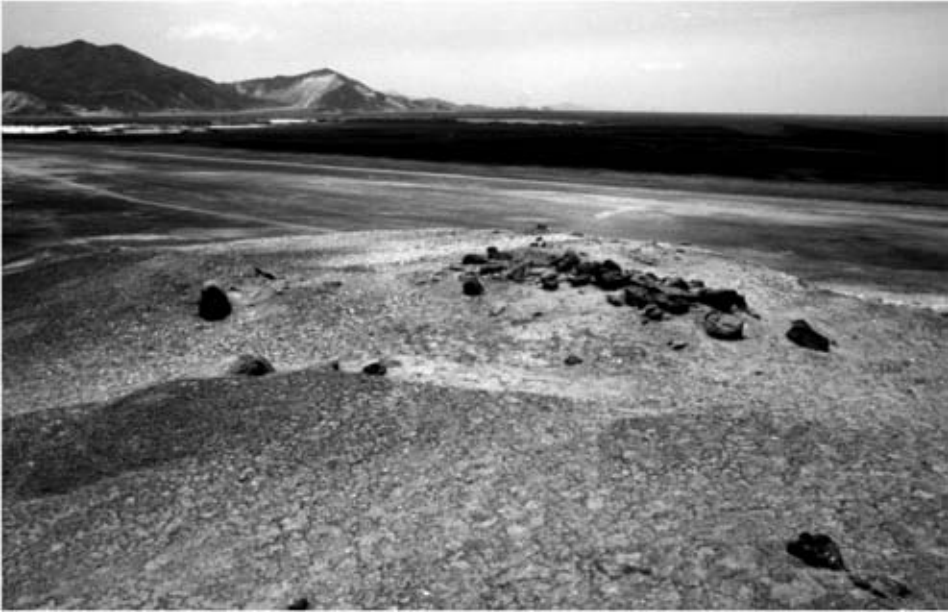
Figure 2.2. View from the Ostra Collecting Station SSW across the fossil bay towards the Ostra Base Camp.

from today? Several factors convinced us that the latter scenario was more likely correct: (1) the similar nature and timing of change at two widely separated locales in different geographic settings; (2) the restriction of warm-water molluscan assemblages to the north coast of Peru and to sites dating before 5800 cal yr BP; (3) the presence of multiple year age classes in the molluscan assemblages, both in the beach and in the sites, indicating that local conditions must have allowed sufficient exchange with the open ocean to prevent hypersalinity; and (4) the moderate diversity of the molluscan assemblages, suggesting long-term stability rather than environmental stress. We thus concluded that for some time prior to 5800 years ago, the coast of Peru north of ca. 10°S latitude was characterized by permanent warm water. From these data, we hypothesized that El Niño did not operate for some period before 5800 cal yr BP; after that time, we saw conditions as essentially the same as today (Rollins et al., 1986).