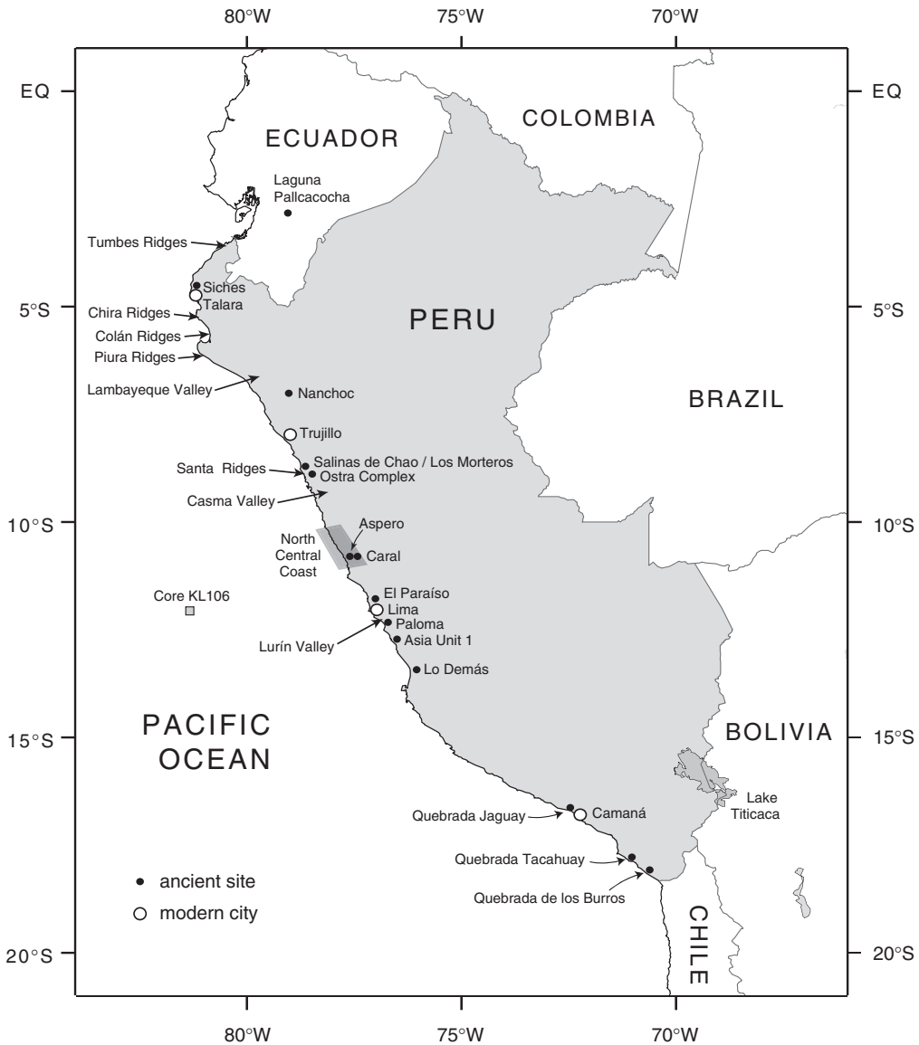
Figure 2.1. Map showing the location of sites mentioned in the text.

1983; Perrier et al., 1994; Andrus et al., 2003). Molluscan assemblages had clearly changed sometime in the centuries immediately following 5800 cal yr BP. Further north, near Talara, Peru, Richardson (1973, 1978) had observed a similar change from warm-water mangrove mollusks to cool-water species, also around 5800 cal yr BP.